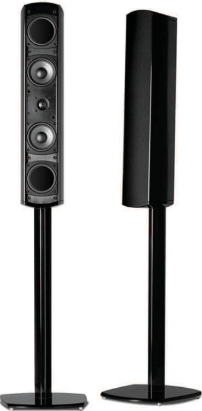
VM20 (FLOOR STAND OPTIONAL)